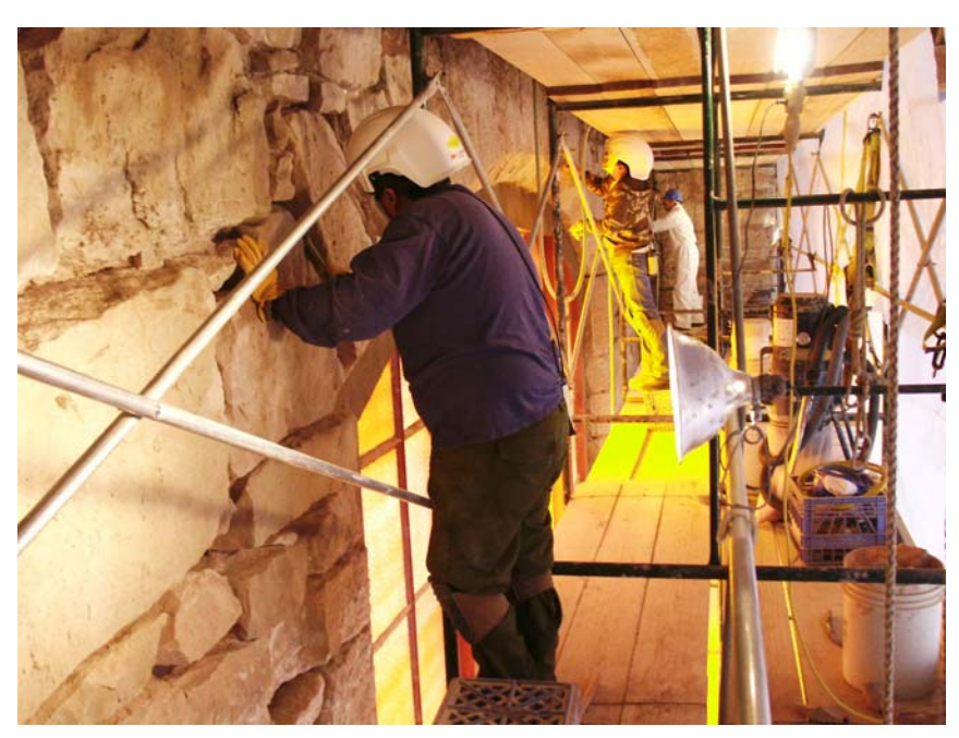
Arylis, Tommy, and Brother David working on the interior west wall.

Last fall the scaffolding was set up on the interior of the west wall. This winter (and next) the crew is involved in repointing the stonework, reinforcing the roof beams, and eventually replacing the badly damaged colored Plexiglas window panels. The crew has made good progress repointing the mortar, which proved to be quite weak. Many passageways for bats and cold air have been plugged up as the stone