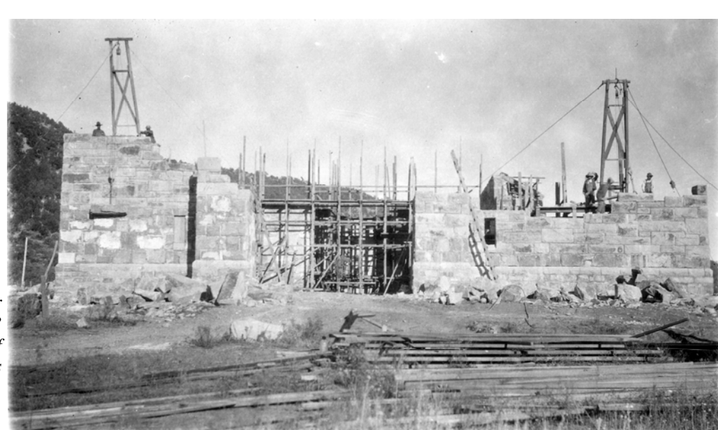
St. Joseph Apache Mission under construction. Circa 1925?