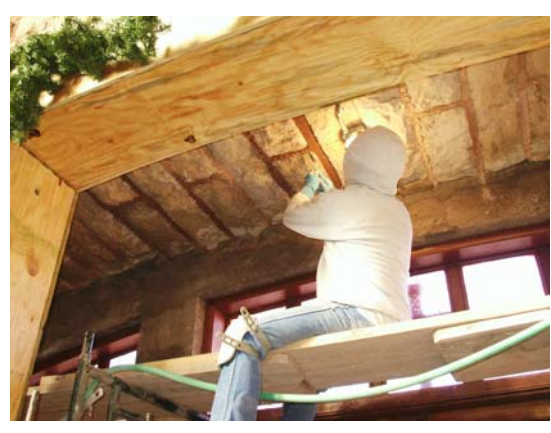
Tommy working on the entryway

Restoration crewmembers Tommy Spottedbird, Arylis Chee and Nikona Hosetosavit have been working diligently and making great progress. In early November the southwest alcove stonework restoration work was completed. That means three alcoves completed, three to go. This alcove served as a good area to instruct new trainees, as well as an easy place for our occasional volunteers to lend a hand.