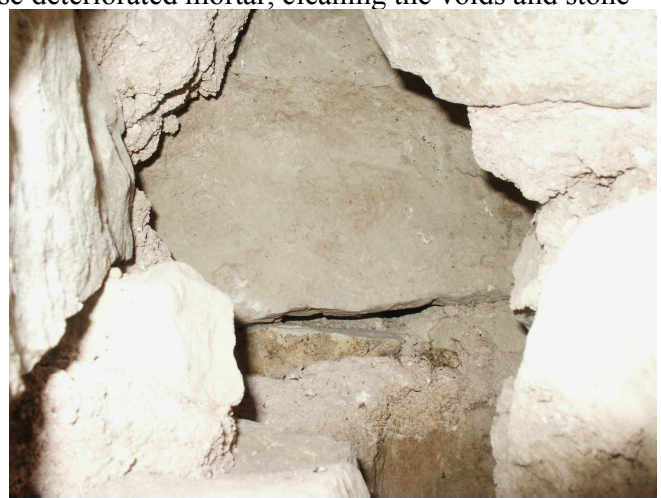
Example of the massive voids in the wall.

Tommy has spent many hours cutting stones from a large bolder to the sizes needed to fill in the large voids. It is always amazing to see how the work continues through each stage, starting from the removing the loose deteriorated mortar, cleaning the voids and stone