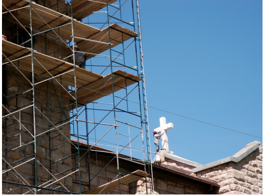
Tommy painting the cross while the crew works on belfry

The crew removed the rotted wood of the belfry replacing the wood and they gave it a coat of primer and fresh paint. While some of the crew worked on that, others worked on repointing the exterior wall of the bell tower to help keep the work on schedule.