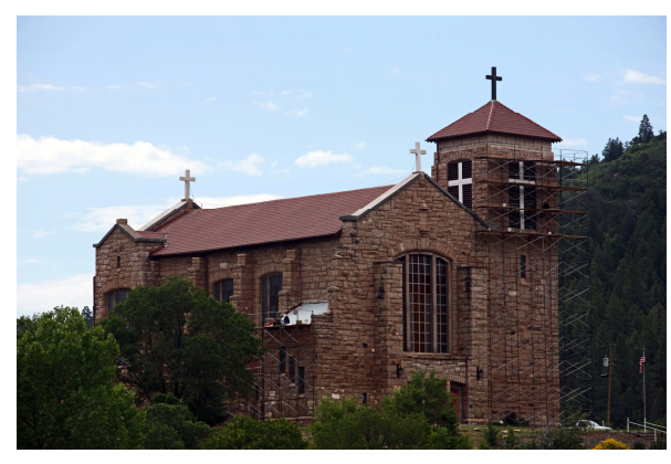
Martin & Sam working on Choir loft roof.

The restoration project took many different directions since our last report. Because we developed a leak over the arch of the sanctuary the crew found that the wall that supports the east cornice was the problem. This wall was covered in stucco and hiding an ugly secret. There were large voids and severely deteriorated mortar that had been covered up in the past fooling the architect to believe we only needed the flashing replaced. After the summer crew removed the stucco and repointed the