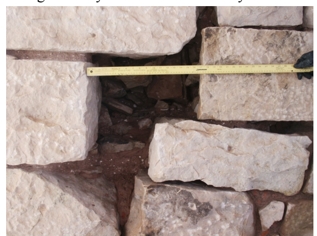
Example of before

The winter brought many different challenges for us. The repointing work went slower than we had anticipated due to the extensive deterioration and missing stones on the top rows on the section of the southeast interior wall. The crew found themselves constantly stopping to cut a stone to the right dimensions in order to replace the missing ones. By the end of March they finished the area and removed the scaffolding. The finished section of the