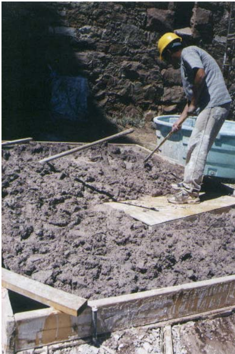
Lime putty and sand was mixed together in a wooden bin, then transferred into a plastic bin and covered with plastic sheeting for storage.